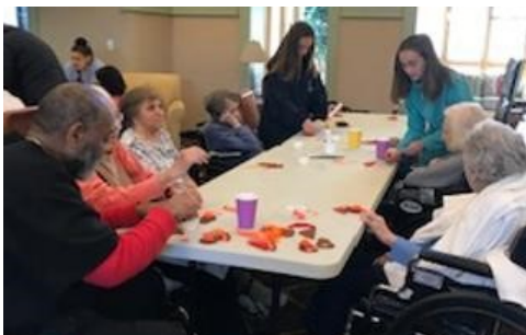
St. Anthony Youth visits the Artman Home