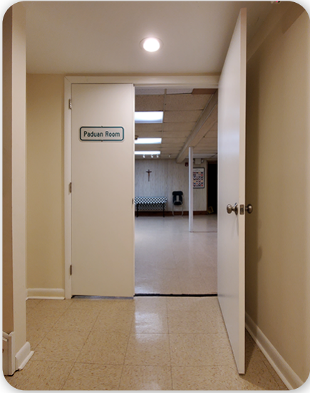
Remodel the Paduan Room

St. Anthony's Jubilee Fund is an annual collection to provide needed funds to address special projects generally not covered by our annual operating budget.