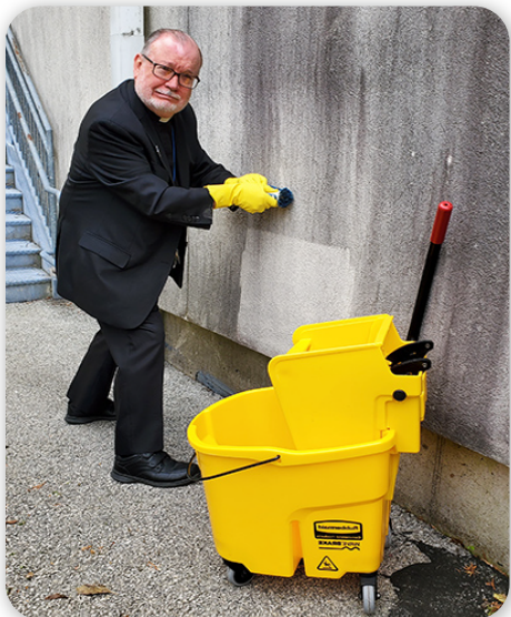
Power wash the church exterior