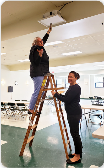
Replace AV system in the hall

Your gift helps to sustain the heritage of faith that has animated St. Anthony Parish since its founding in 1886. From the beginning, our parishioners have answered the call for support with generosity and sacrifice. Our heritage of faith is YOU!