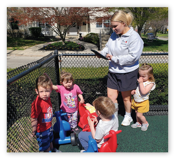
New WIFI necessary for many program functions

St. Anthony of Padua Parish 259 Forest Avenue, Ambler, PA 19002 215-646-4742 www.saintanthonyparish.org