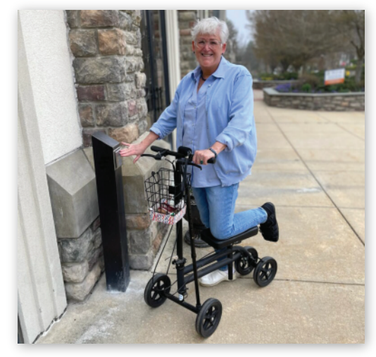
Repair handicapped door

St. Anthony's Jubilee Fund is an annual collection to provide needed funds to address special projects generally not covered by our annual operating budget.